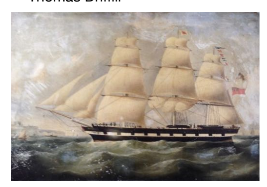
The Bark "Maori"