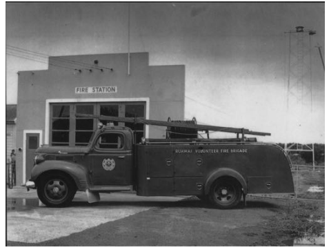
The Fargo Fire Engine was purchased in 1957

After the mention of the Ruawai Fire Brigade I thought readers might be interested in how it all began. At the AGM of the Ruawai Progressive Society, held in the Settlers Hall in June 1952, one of the matters raised was the question "Do we need a Fire Brigade in Ruawai..?" There were five ratepayers in attendance and all voted in favour. After a short discussion it was left to those people to get it up and running.