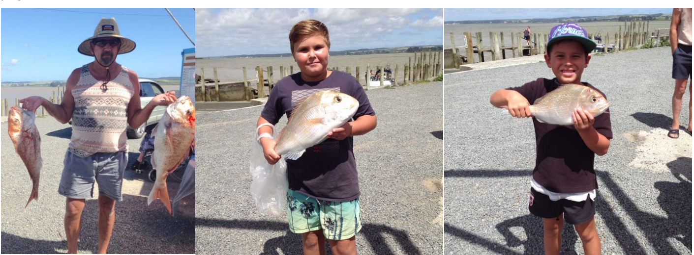
A nice couple of fish at 4.180 & 4.915 kg

The Ruawai Boating Club held a two day fishing competition the weekend of 20th & 21st of February. This competition was to be held on Waitangi weekend but had to be postponed due to weather conditions. Eighty-five anglers entered. The first day saw reports of good numbers of Snapper landed. Gurnard, Trevali and Kingfish numbers were low. Sunday was a bit quieter for some of the entrants. Overall it was a fantastic weekend of boating followed by a gettogether and dinner at the local Sports Club. The Club's next event "Take a kid fishing" was held on March 6th. See page 10.